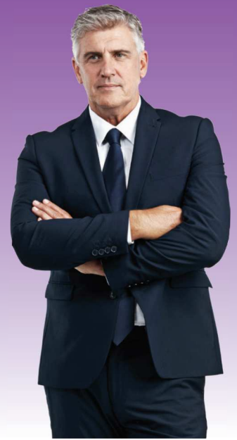
High resolution reports for MANAGERS