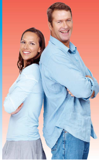
Guardian tools for PARENTS