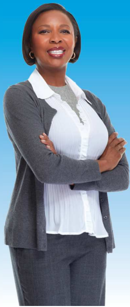
Classroom management for TEACHERS