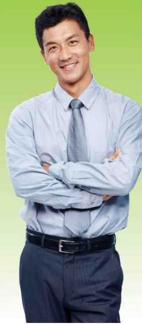
Device management for IT ADMIN