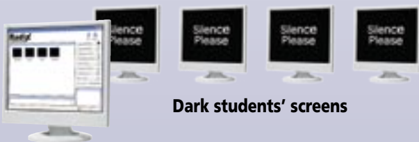
Dark students' screens

Radix Smart Class provides an exclusive downtime-free environment, enabling full remote control on optional Radix instant recovery products. In the event of failure, the teacher can instantly recover disabled computers by simply pressing the Instant Remote Recovery button.