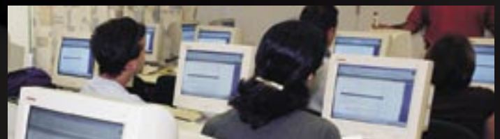
Broadcast to students' screens (an alternative to overhead projector)

By simply pressing a button, the teacher can broadcast high quality presentations to students, keep an eye on students by monitoring their screens, blank screens for attention and instantly recover disabled computers without disturbing the entire class.