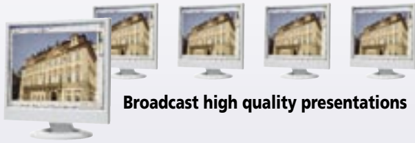
Broadcast high quality presentations

Radix Smart Class is a professional software, enabling effective classroom control, advanced interactive learning and full-screen, flicker-free, high quality video broadcast (even when running on a slow network).